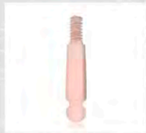
琴軫型號一 Tuning Peg Type 1