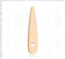
琴軫型號二 Tuning Peg Type 2