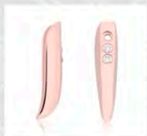
冠角型號一 Ceremonital cap Type 1