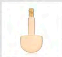
雁足(圓) Goose Foot (Circle)