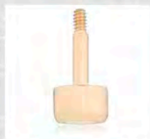
雁足(平) Goose Foot (Flat)